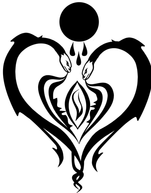
The sigil of Eisheth Zenunim

Perform this working in the same way as the invocations of Naamah and Agrat. Prepare your temple/ritual space, and leave the chalice on the altar empty. Stand or sit in a comfortable position and put the sigil of Eisheth Zenunim in front of you. The sigil represents the serpents of Lilith and Samael entwined, forming the astral womb of the Dark Goddess and Eisheth's unholy grail from which the Initiate drinks the blood of the moon. Their shape resembles a heart, typifying the sexual character of this gnosis. The moon dripping blood is symbolic of Gamaliel, the astral garden ruled by the Harlot.