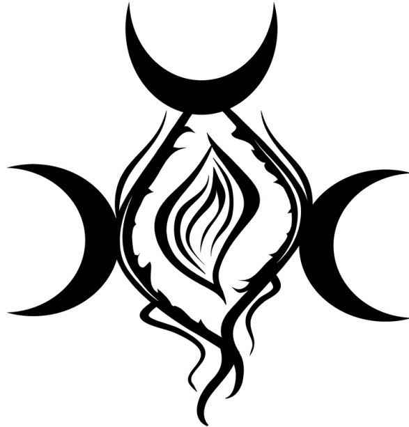
The sigil of Naamah

From this day forward, through the invocations of Naamah, Agrat and Eisheth Zenunim, you will focus on your personal intent, using your sexual energies to empower your desire. Again, prepare your temple/ritual space for the working. Put all items on the altar. This time the chalice should be empty – on this and the two following days you will fill it with your intent mixed with your vital essence - sexual fluids and/or blood.