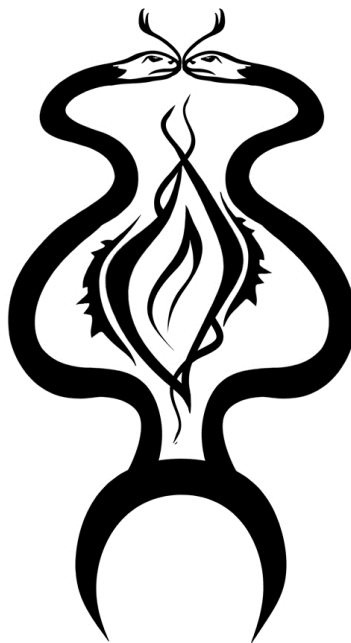
The sigil of Agrat bat Mahlat