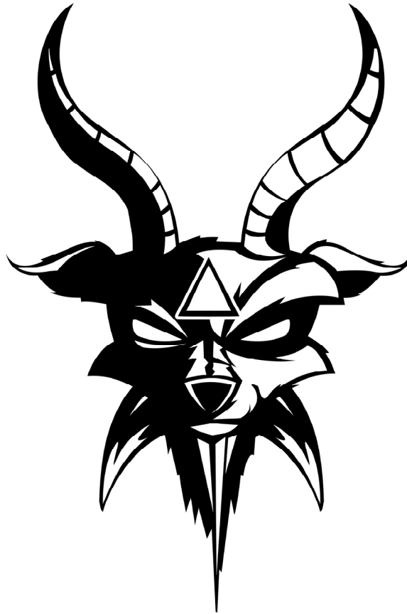
The Mask of Mephistopheles

Take off the mask, extinguish the candles and close the ritual with a few personal words.